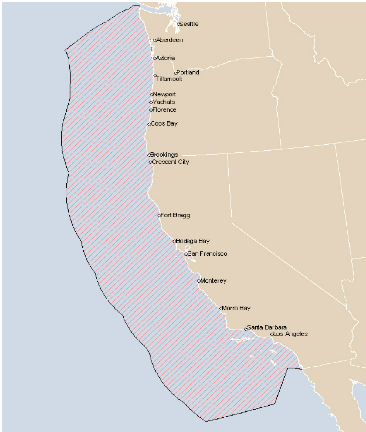
Figure 1-1: The U.S. EEZ seaward of the Pacific Coast, the project area for the EIS.