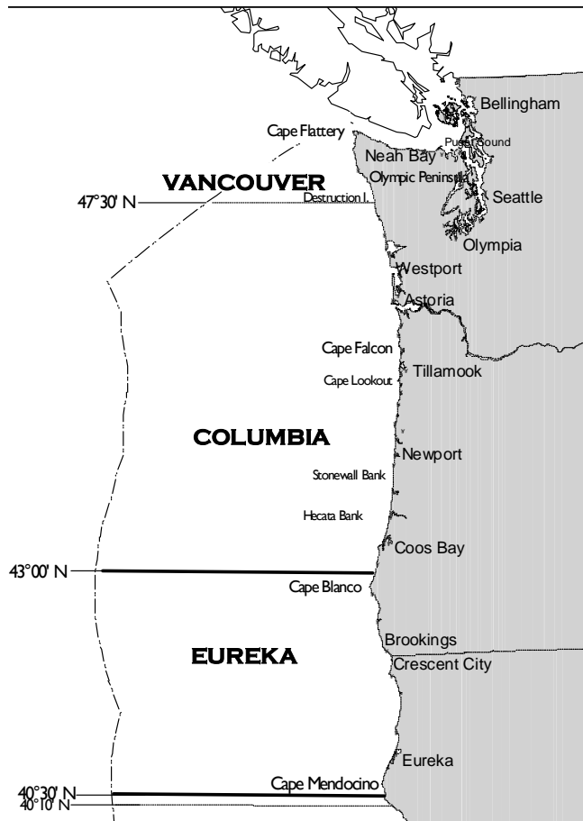
Figure 1: The action area, showing major coastal communities and management areas.

There is a trend towards increasing concentration of ex-vessel revenue in major fishing ports. This may indicate a general trend toward agglomeration (the concentration of firms specializing in an activity, such as fish processors and shipyards, in a geographic area). For all groundfish fisheries, the share of coastwide revenue flowing to the top-three ranked ports increased, especially after 2009. This trend seems to be driven primarily by landing patterns in the shorebased trawl/IFQ fishery (NMFS 2014a). Newport, Astoria, and the South and Central Washington Coast are in the top three of the rankings for the trawl (whiting and non-whiting) and non-nearshore fishery sectors. The nearshore fishery figures more prominently on the Oregon-California border and in the Morro Bay port group. (Note that non-nearshore fixed gear fisheries are also important in these three ports as evidenced by the primary and secondary fisheries identified in Table 2 Commercial Fishery Engagement.