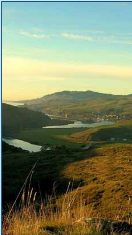
The Russian River estuary.