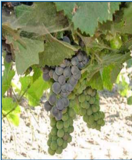
Grapes growing in the Russian River watershed.