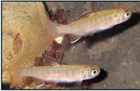
Juvenile coho salmon in the Russian River.