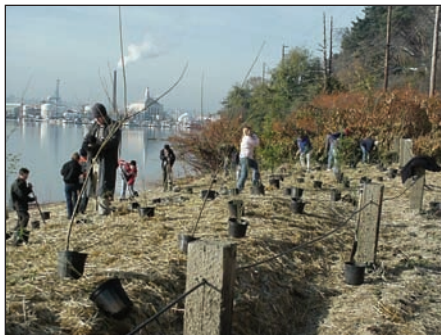
Commencement Bay, Tacoma, WA - see case highlights.