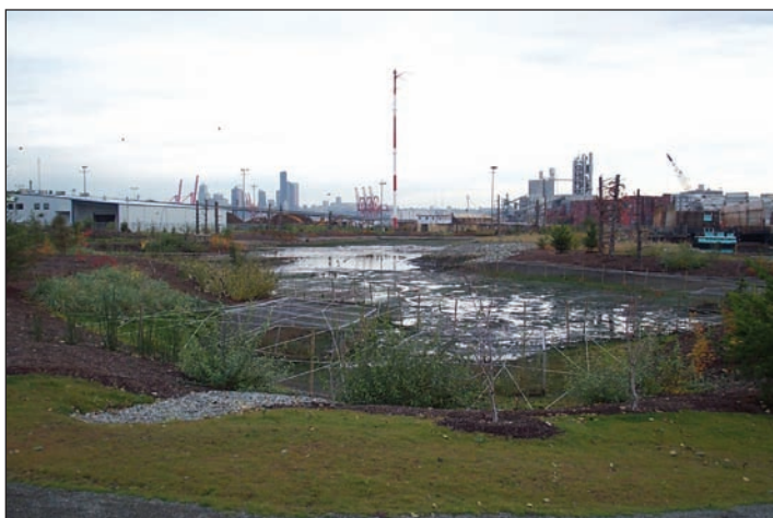
Elliott Bay and Lower Duwamish Waterway, Seattle, WA - see case highlights.