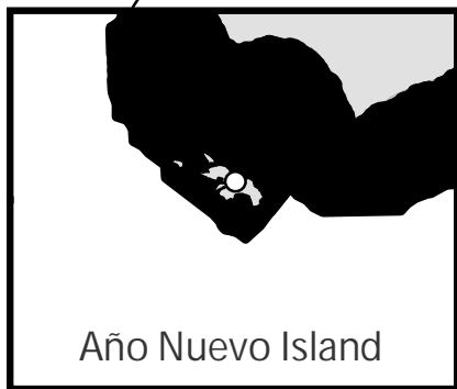
Año Nuevo Island