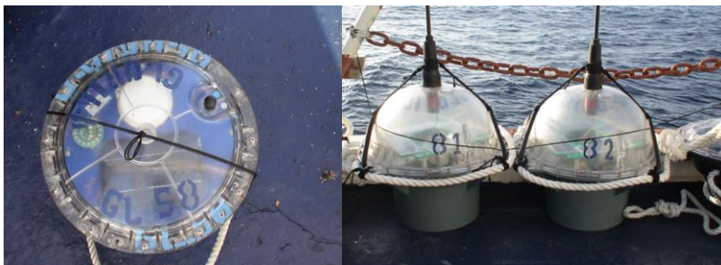
Figure 2. Examples of FAD identification on satellite buoys.

Answer: FADs must be marked in a manner that is durable. For example, epoxy-based paint or an equivalent in terms of lasting ability that is visible at all times during daylight could be used.