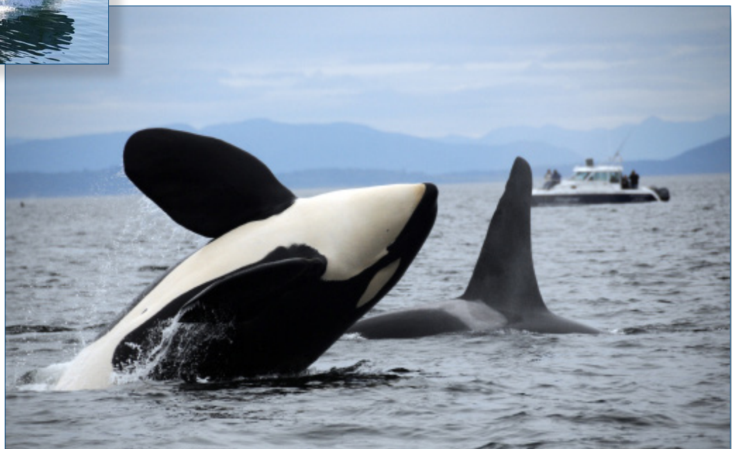
Right: NOAA Fisheries has designated Southern Resident killer whales a "Species in the Spotlight," one of eight species nationwide at high risk of extinction, and has developed an action plan to address threats to the whales.