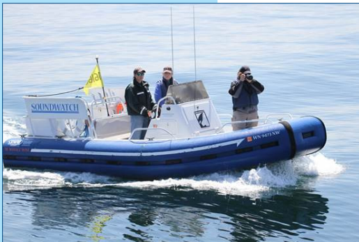
Above: Soundwatch volunteers monitor boat traffic around the Southern Resident killer whales.

Research has found that killer whales spend less time foraging and more time traveling in the presence of vessel traffic and that vessel noise may cause them to expend more energy to communicate and echolocate to find food. Vessel traffic and noise has been identified as one of three main threats to the Southern Resident population, in addition to the accumulation of chemical contaminants and reduced availability of their favored prey, salmon. Given poor compliance with earlier voluntary vessel guidelines designed to protect the whales, NOAA Fisheries in 2011 issued federal regulations, which limited vessel traffic within 200 yards of the whales and 400 yards of their apparent path. We committed to review the effectiveness of the regulations after they had been in effect for five years.