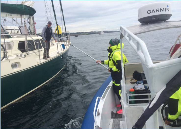
Soundwatch volunteers provide information to boaters watching the whales.

The review assessed research and data comparing the five-year period prior to adoption of the regulations to the five-year period afterwards. The review examined five measures of progress: education and outreach, enforcement, vessel compliance, biological impacts and economic impacts. NOAA Fisheries also commissioned an economic study to evaluate concerns that the regulations would negatively affect the commercial whale watching industry and local communities that rely on tourism.